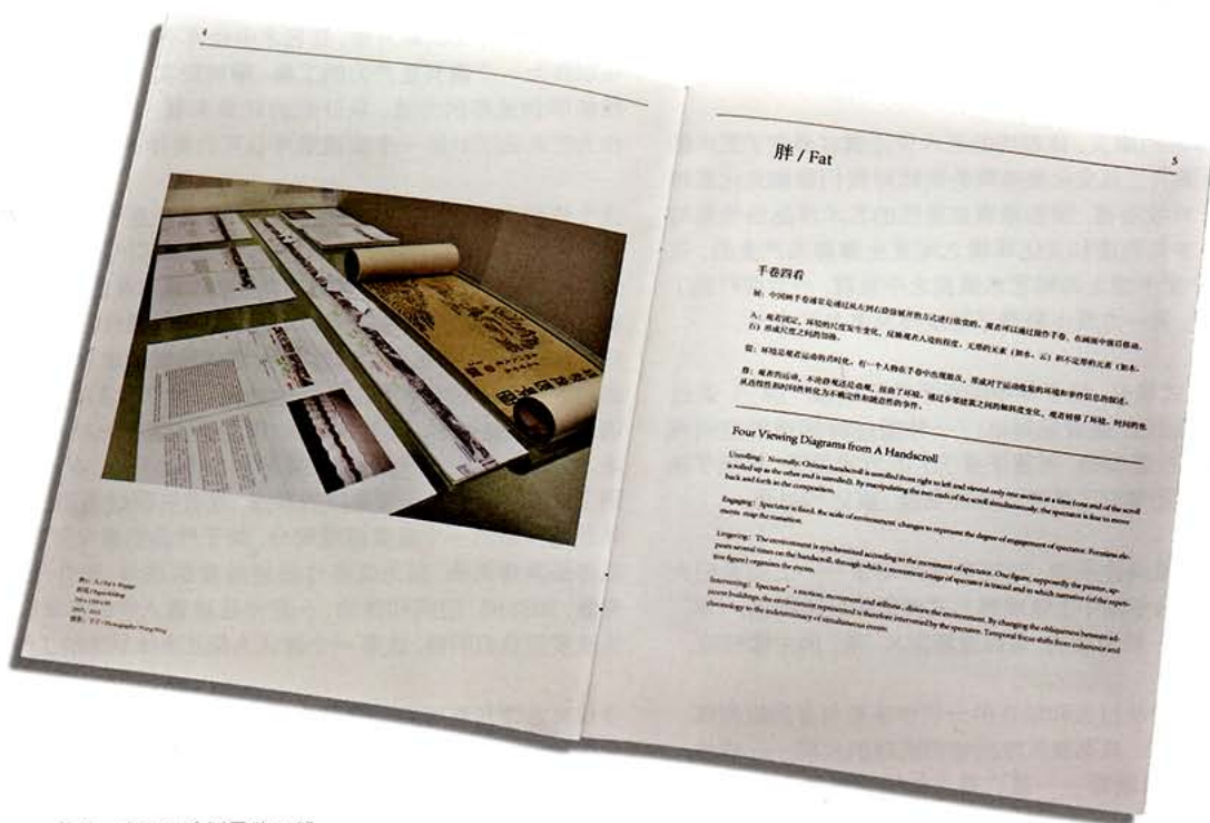
范凌: 胖平飘计划展览图册 Exhibition Catalog