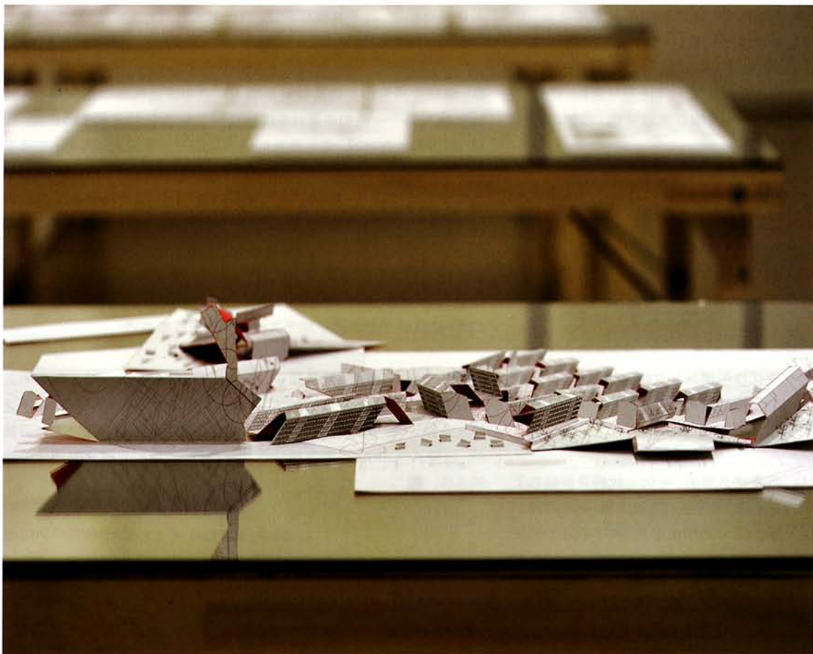
胖平飘计划: 平 Fat Flat Float Project: Flat